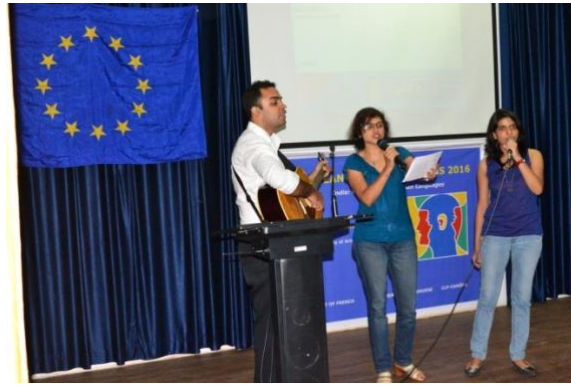
Canção- Portuguese Song