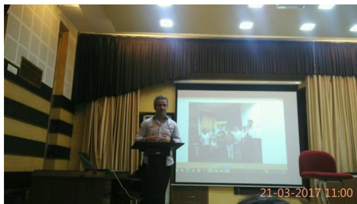
Portuguese writer José Luís Peixoto inaugurates the Reading Session